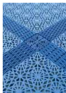
Expansion strips and Expansion Cross-piece.