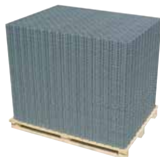
Pre-assembled sections 1,2 x 0,9 m