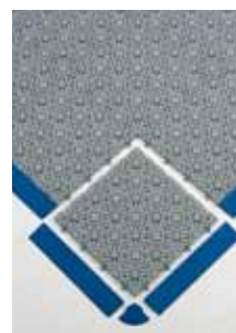
Edge strips and Corner strips are suitable for installation at stairways.