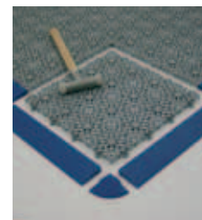
Edge strips and Corner strips