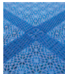
Expansion strips and Expansion Cross-piece